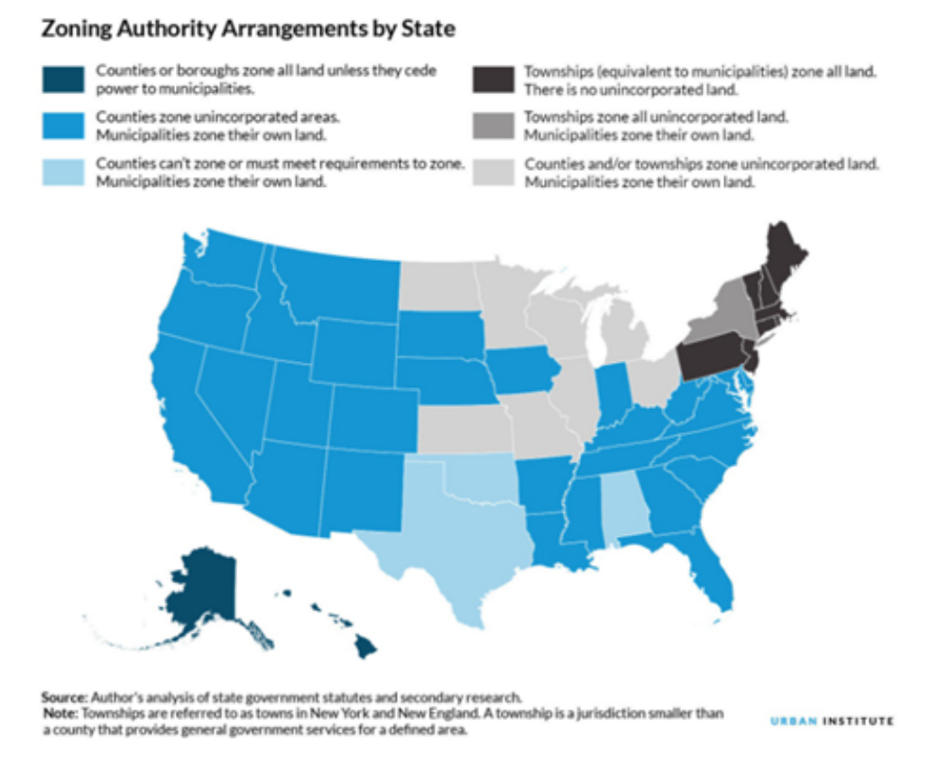
Figure 2: Zoning authority by state (Urban Institute, 2019)

Thus, existing research on state and local authority as it pertains to zoning leaves open some critical gaps in our understanding of how renewable energy projects are governed. We have thus far provided a brief history of zoning authority, examined home rule and Dillon's Rule and the varying ways in which they are deployed and interact, and elucidated the meaning of "local" in zoning authority. An important question remains, however: if state and local zoning law are silent about the legality of a certain land use, does that mean that use is allowed, forbidden, or something in between? This is particularly important in the context of zoning for renewable energy projects – if rules for renewables are not specifically delineated in state or local code, how do governing bodies decide whether or not they are permissible. Our analysis will attempt to answer this question, examining the way that these zoning "silences" are interpreted in the zoning of renewable energy projects and how unlisted zoning uses are treated.